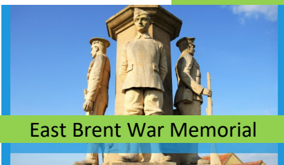
East Brent War Memorial