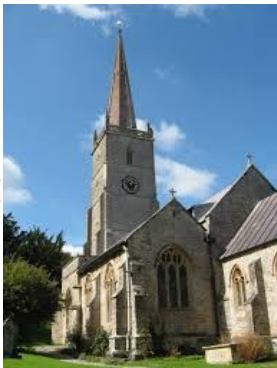
St Mary's Church, East Brent